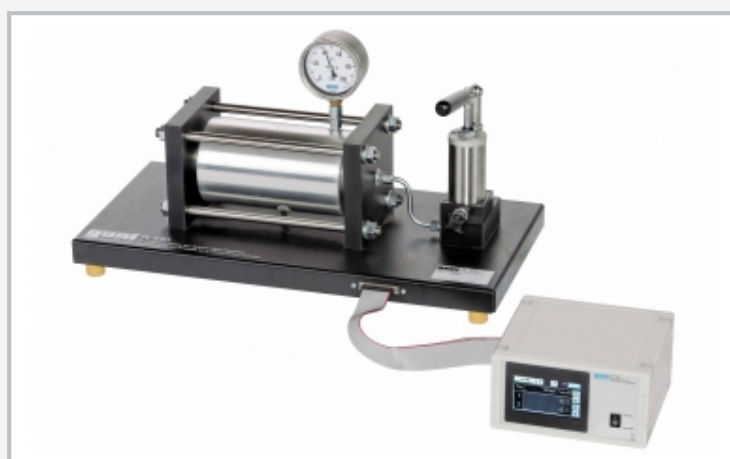
Example application: FL 152 in conjunction with FL 140 (stress and strain analysis on a thick-walled cylinder)