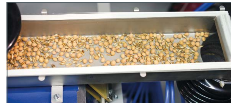
CE 275 during a trial run: The vibrating trough evenly conveys the mixture of spelt husks and cherry stones to be separated from to the zigzag sifter.

The waste mixture to be separated (feed material) is conveyed evenly into the zigzag sifter by a vibrating trough. The fan generates the upwardly-directed airflow necessary for separation through the zigzag channel. You can adjust the mass flow rate of the feed material and the volumetric flow rate of the air. The fraction of the feed material transported along with the air is then separated in a cyclone. This allows a closed circuit for the air flow. The zigzag sifter and cyclone are each equipped with differential pressure measurement.