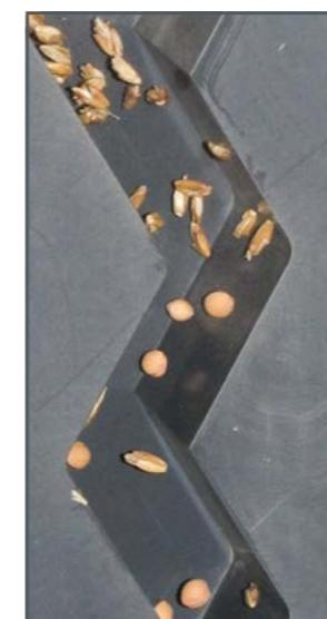
In the zigzag channel, the separation of the mixture can clearly be observed.