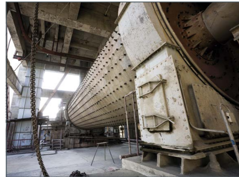
Large-scale ball mill in waste management

Many processes used in the recycling of waste are favoured by a small particle size. Waste usually has to be comminuted first for this reason. Various techniques such as ball mills are used to do this.