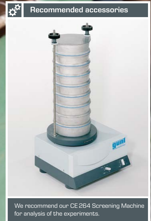
We recommend our CE 264 Screening Machine for analysis of the experiments.

Product No. 083.27500 More details and technical data: gunt.de/static/s4791_1.php