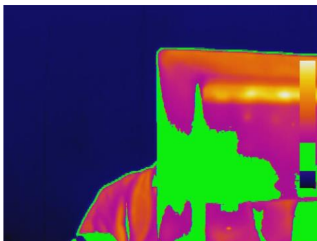
Advanced analysis: Isotherm feature