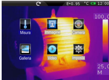
General menu with icons

The THT60 model is a professional infrared camera with capacitive touch-screen TFT color display for quick and intuitive advanced use by any kind of thermograph operator