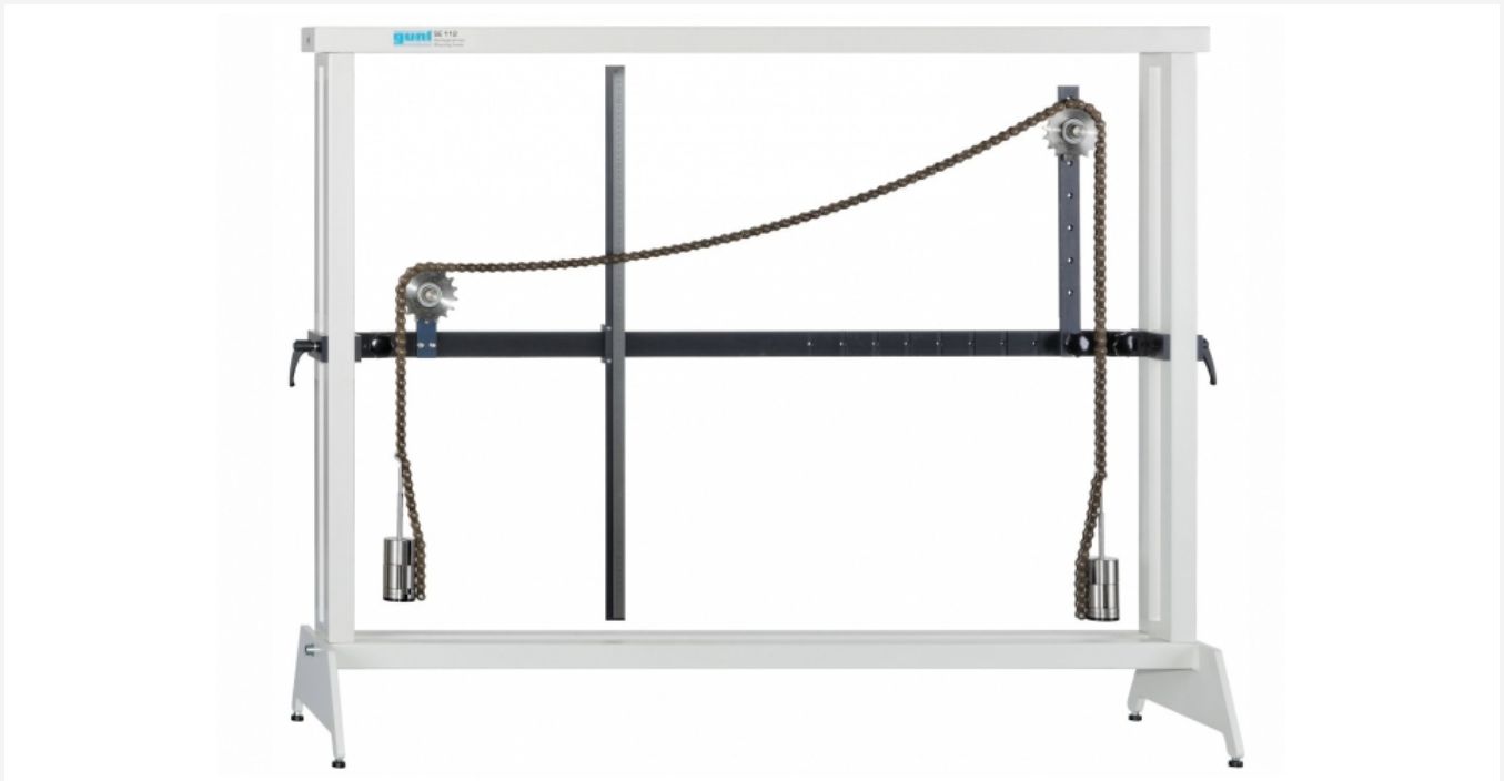
The illustration shows SE 110.50 in the frame SE 112.