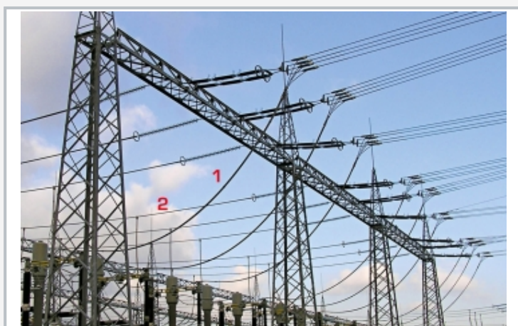
Free-hanging cables in practice (portal): 1 stay cable, 2 power line, similar to overhead line